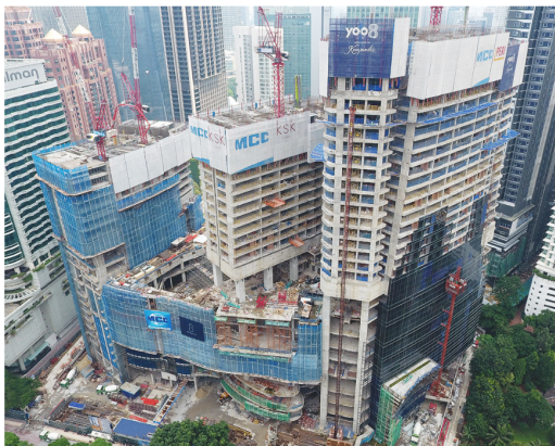
Friday, January 17th, 2020 at News | Property